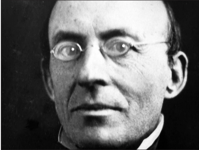
William Lloyd Garrison 1805-1879

William Lloyd Garrison was an American reformer best known as the editor of The Liberator , an abolitionist newspaper. Garrison advocated immediate emancipation for all slaves and famously said that on this position he would not retreat a single inch.