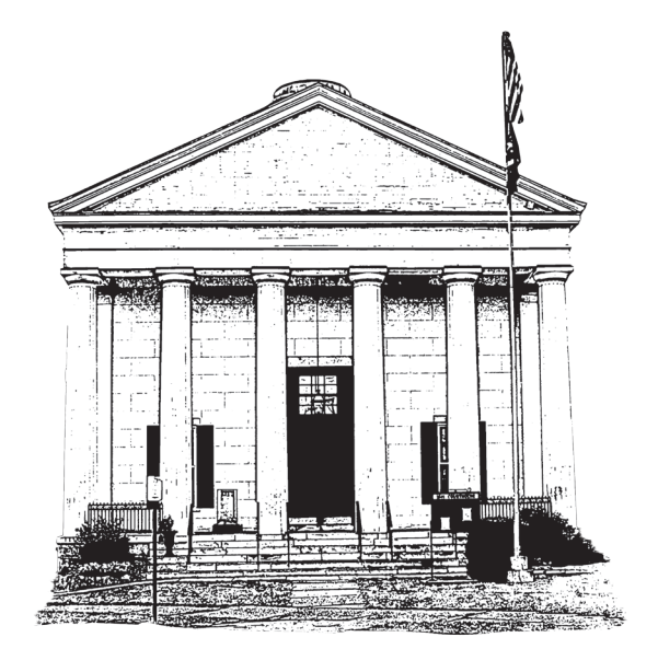
Royal Fireworks Press Unionville, New York