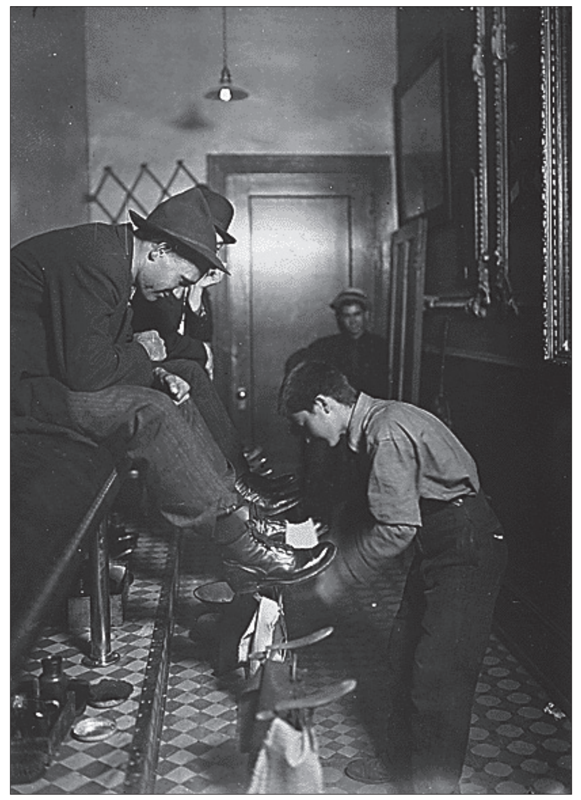
Boy working in a shoe-shining parlor, Indianapolis, IN, August 1908