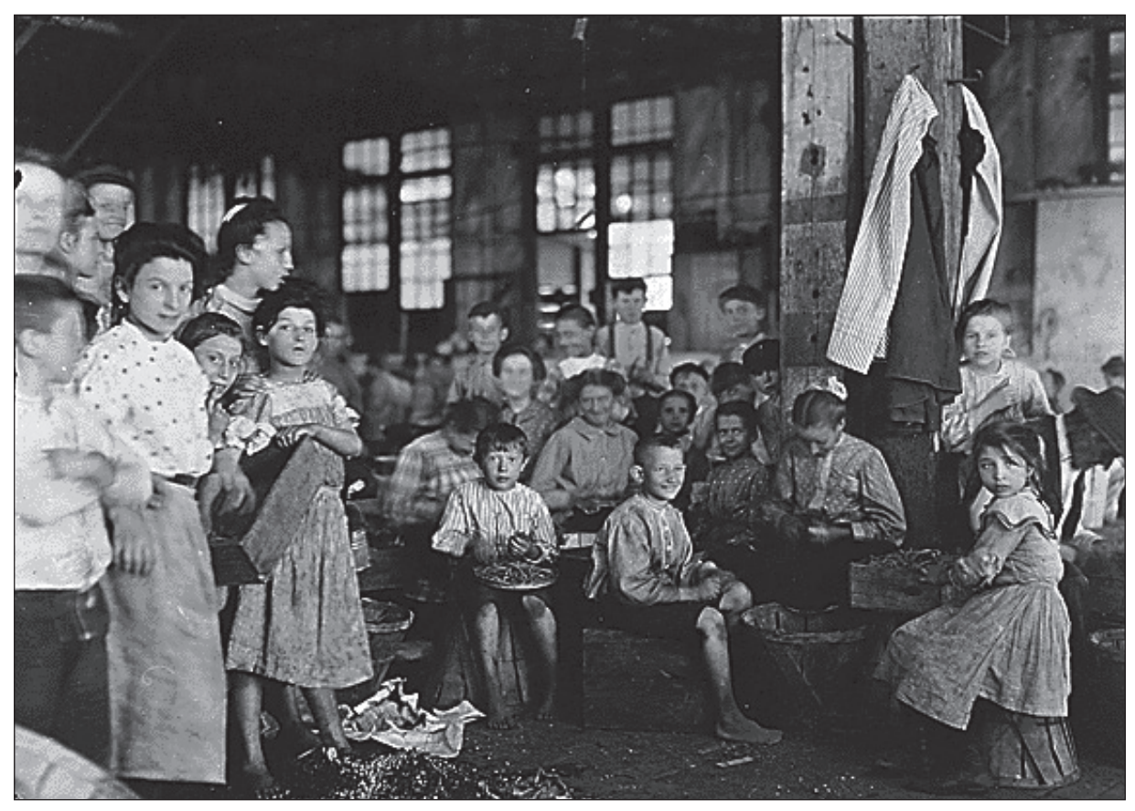
Workers stringing beans, Baltimore, MD, June 7, 1909