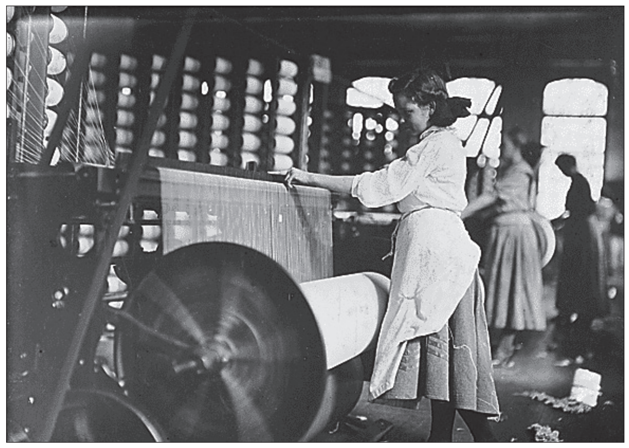
Girls at weaving machines, Evansville, IN, October 1908