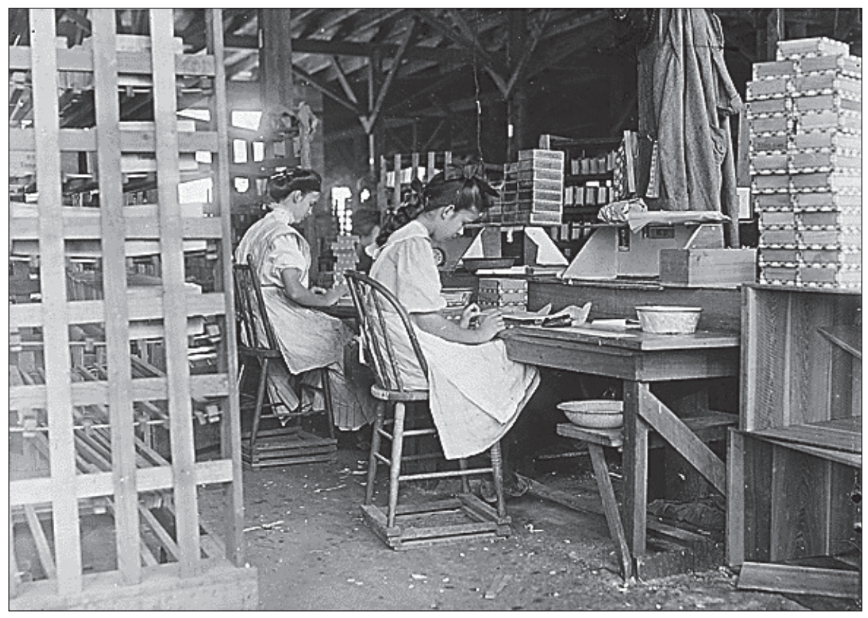
Girls working in a box factory, Tampa, FL, January 28, 1909