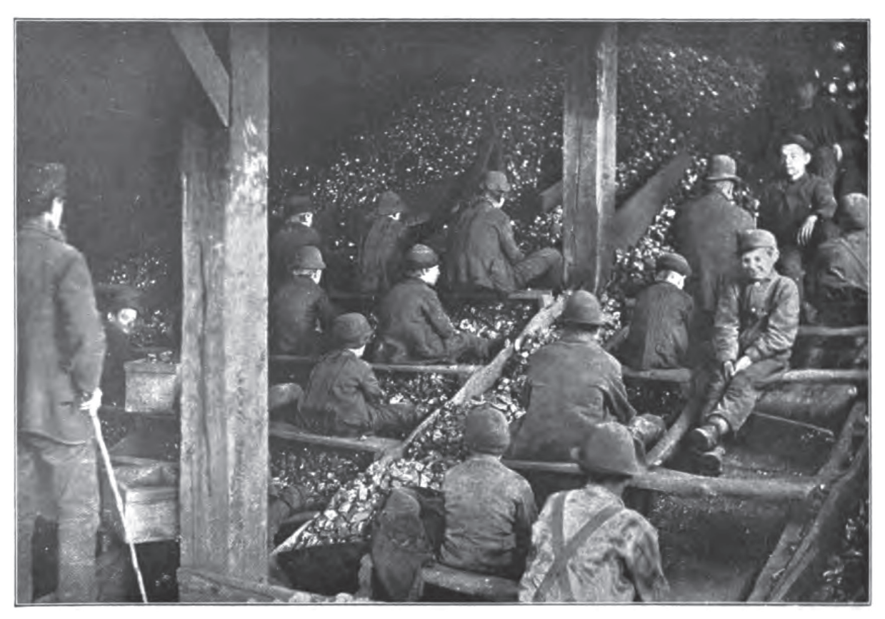
BREAKER BOYS AT WORK