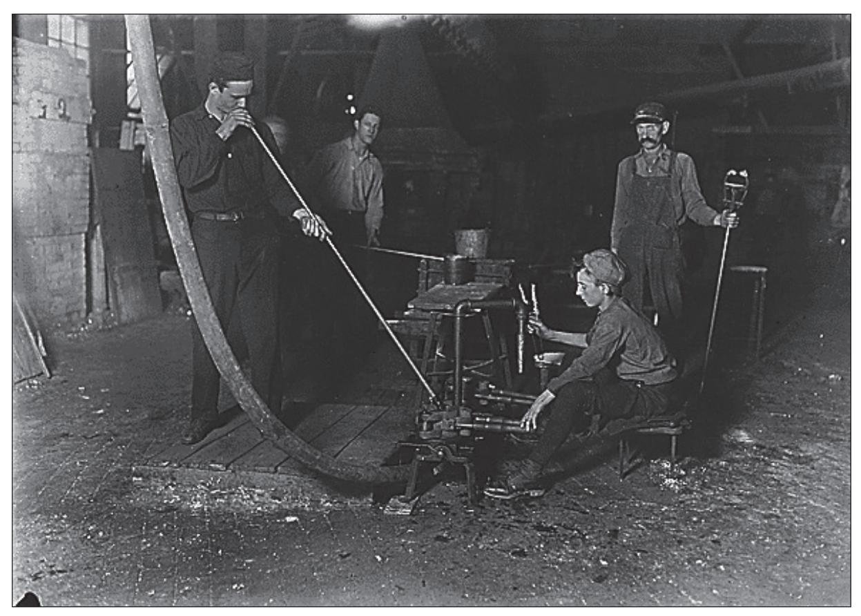
A glass blower and mold boy, Grafton, WV, October 1908