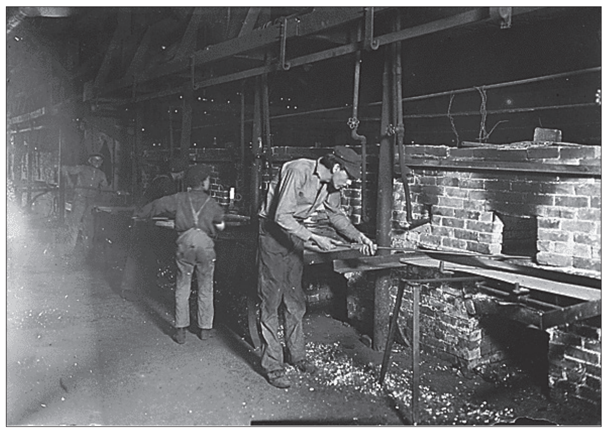
Children working in a bottle factory, Indianapolis, IN, August 1908