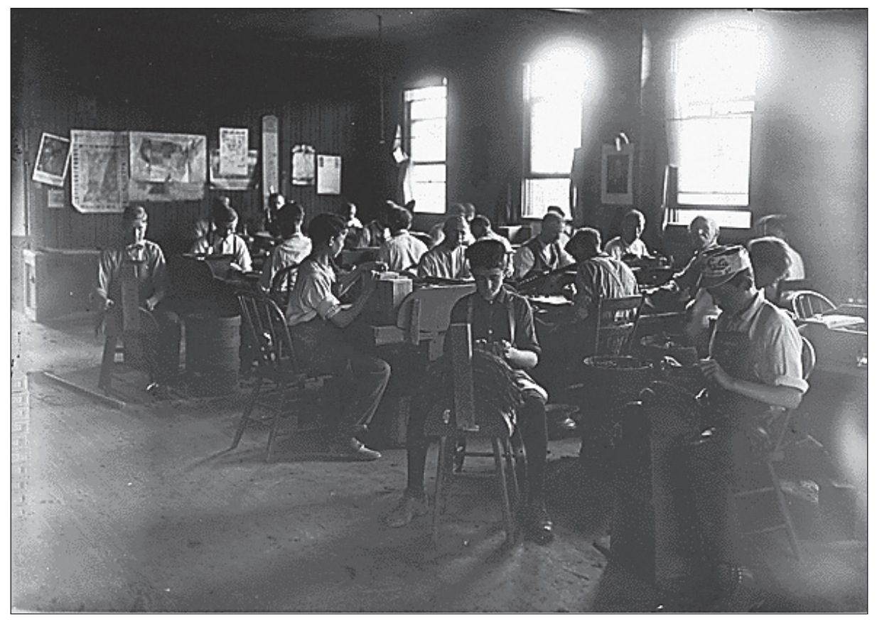
Boys in a cigar factory, Indianapolis, IN, August 1908