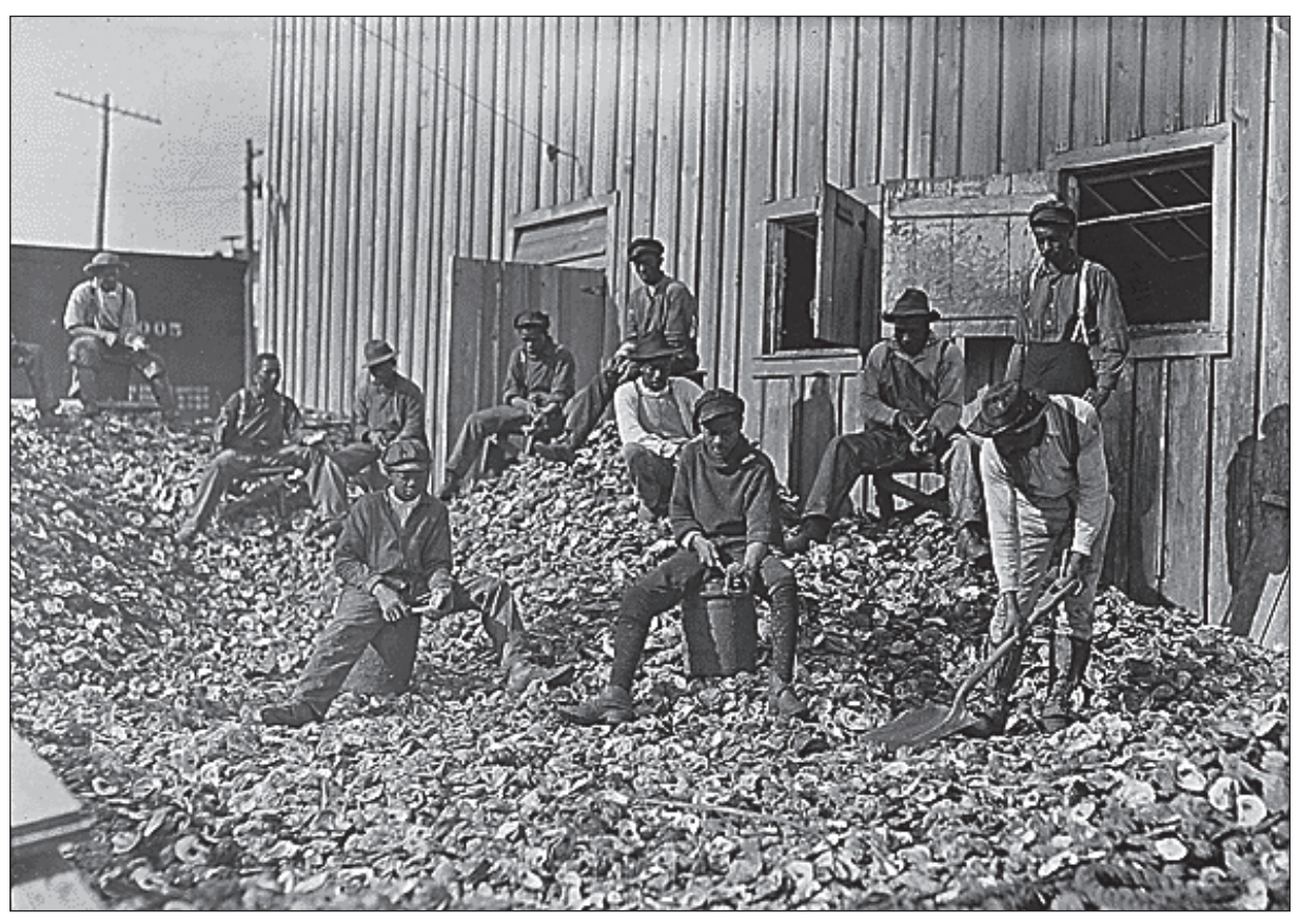
Young boys shucking oysters, Apalachicola, FL, January 25, 1909