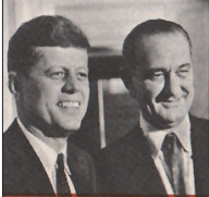
Senator Lyndon B. Johnson of Texas is the Democratic candidate for Vice President. As Senate Majority Leader he led the fight for the enactment of the Civil Rights Bills of 1957 and 1960. Senator Johnson has pledged to "campaign from one coast to the other on the platform of the Democratic party."