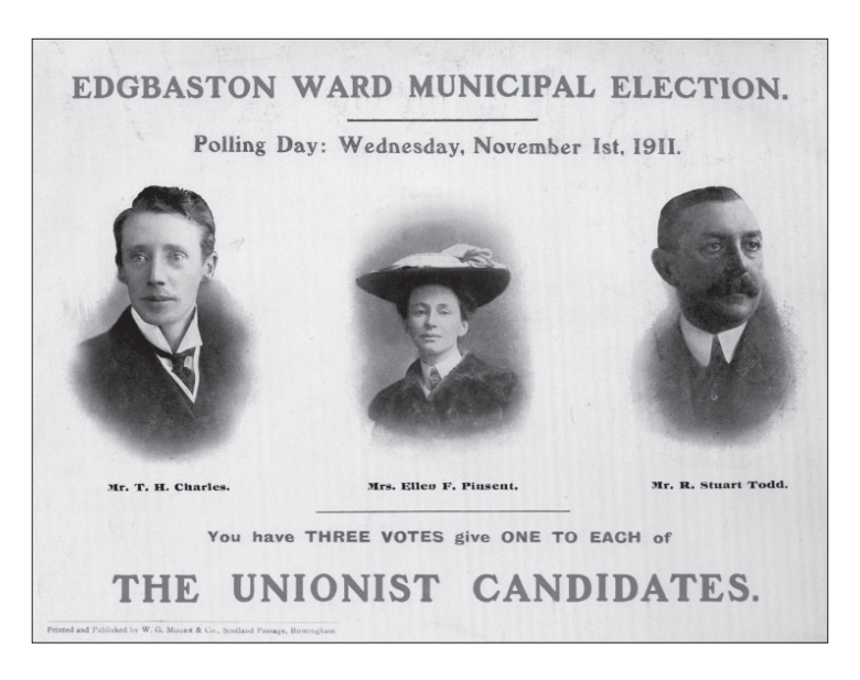
"Oh." I winced at the poster.

My mother frowned at me. "You don't like it."