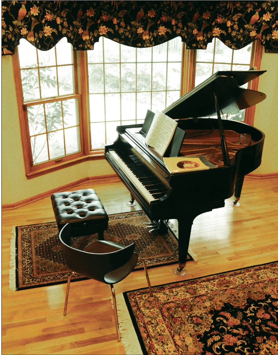
The Haroutounian Piano Studio