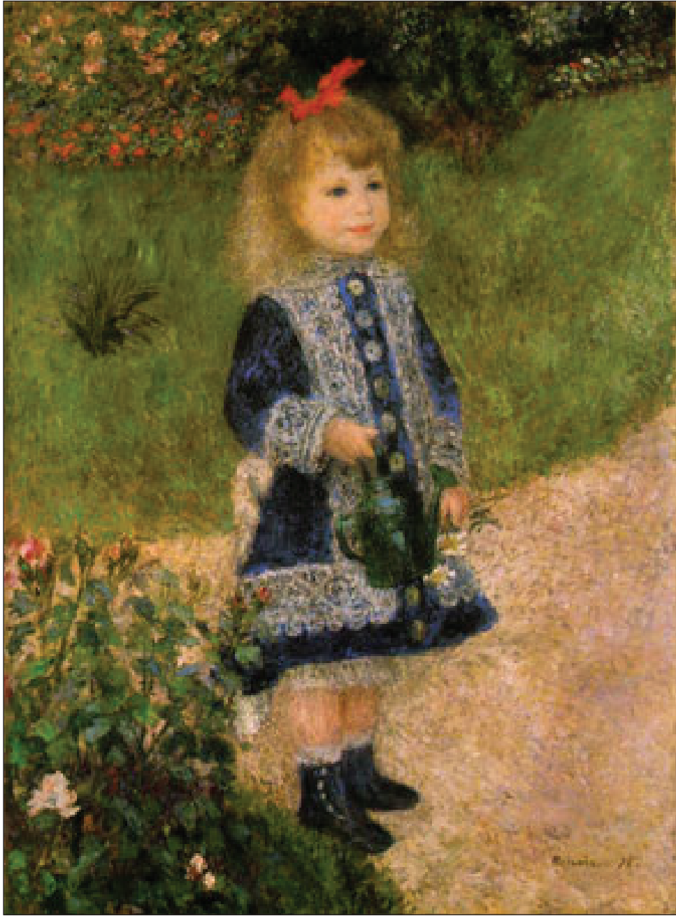
August Renoir, Girl with the Watering Can , 1876, National Gallery of Art, Washington, DC