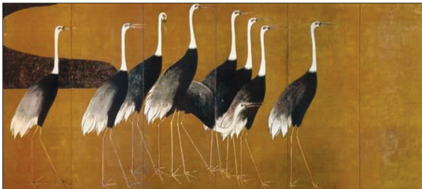
Ogata Korin, Cranes , 1658-1716, Freer Gallery of Art, Washington, DC