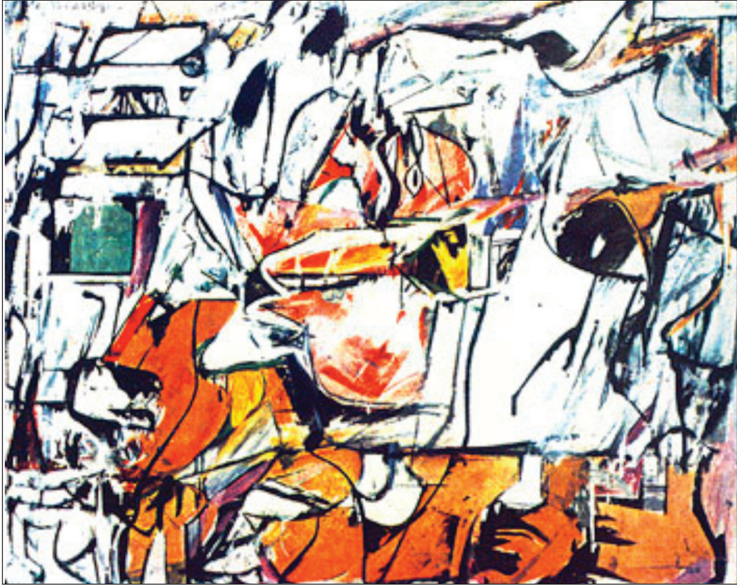
Willem de Kooning, Asheville , 1948, The Phillips Collection, Washington, DC