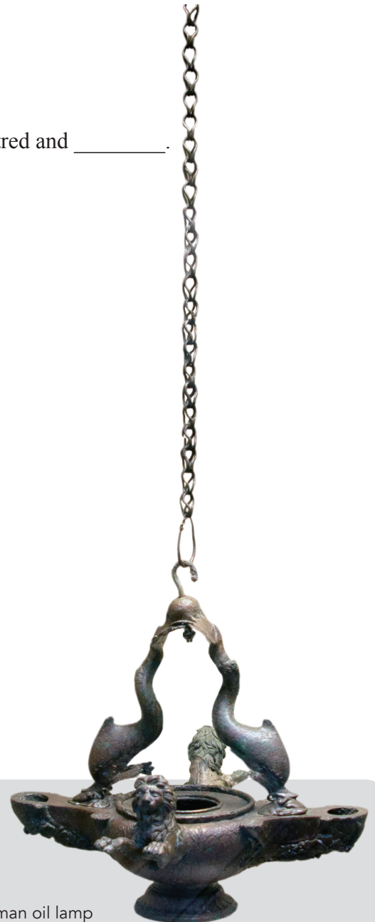
Roman oil lamp