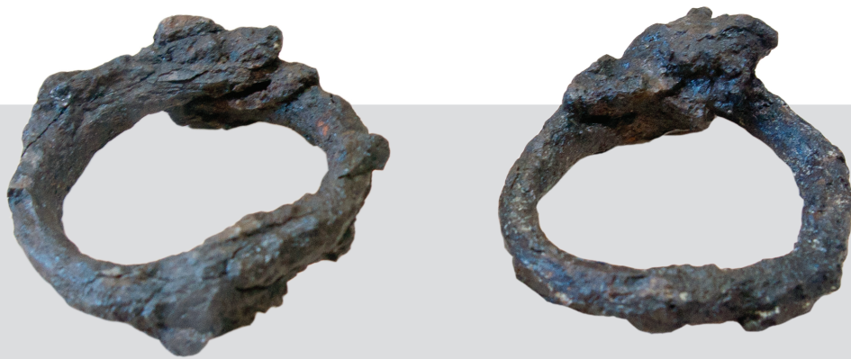
These shackles would have hampered the slave who tried unsuccessfully to flee Vesuvius when it erupted.

What if you suddenly realized with complete certainty that solipsism was true, and that you actually were the only living thing, and that everything else, living and inanimate, was only your imagination? How would you feel?