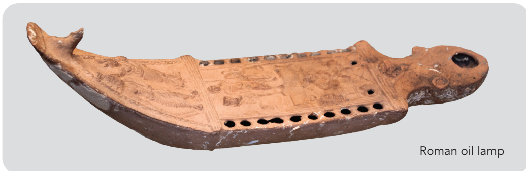
Roman oil lamp

scattered fragments of memory disjecta membra mind present, mind lost, mind losing, ineluctable fragments... da doo ron ron ron da doo ron ron disinterred recollections reinterred autoincisive self-awareness. it has become/ infra dig to/become meself becoming/ infra dig in a solipsism of gentle truculence;