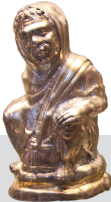
This little statue of a slave boy shows him chained to the box that is between his feet.