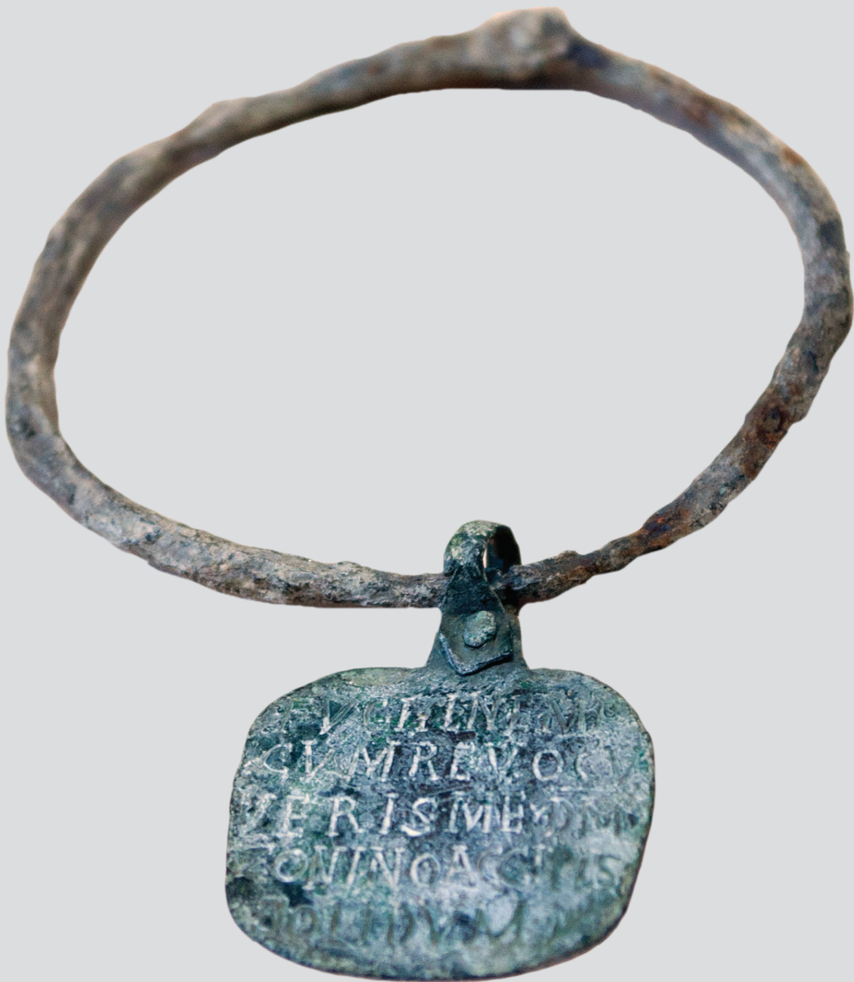
This slave collar bore a message that asked that the slave be returned for a reward. It is a telling fact that sometimes when archaeologists find just the inscribed disc, they cannot be certain whether it attached to a collar for a slave or a dog.