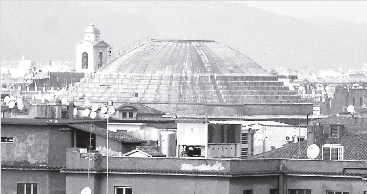
The concrete dome of the Pantheon viewed from Capitoline Hill as seen in modern Rome

Roman concrete was based on mixing lime, an aggregate of rocks, and volcanic ash, which had a high content of alumina and silica. Roman concrete has proved durable and resistant to salt water and other elements at a level far beyond modern mixtures. The Romans were fortunate in that large quantities of the volcanic ash—called pozzolana —were found around Naples and Rome. Moreover, they understood that the best concrete was made with as little water as possible and was applied sparingly and tamped down vigorously. It was not poured from massive vats as is the case today, nor would a great gob of it have been plopped by a Roman mason onto a layer of brick and then spread wetly from brick to brick across many feet.