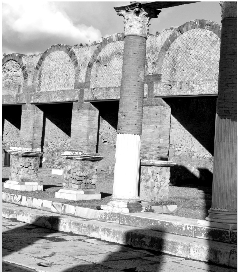
In the Forum of Pompeii, we can see another example of a builder using embedded arches to relieve the load on the lintels of a series of openings in the front of a building.