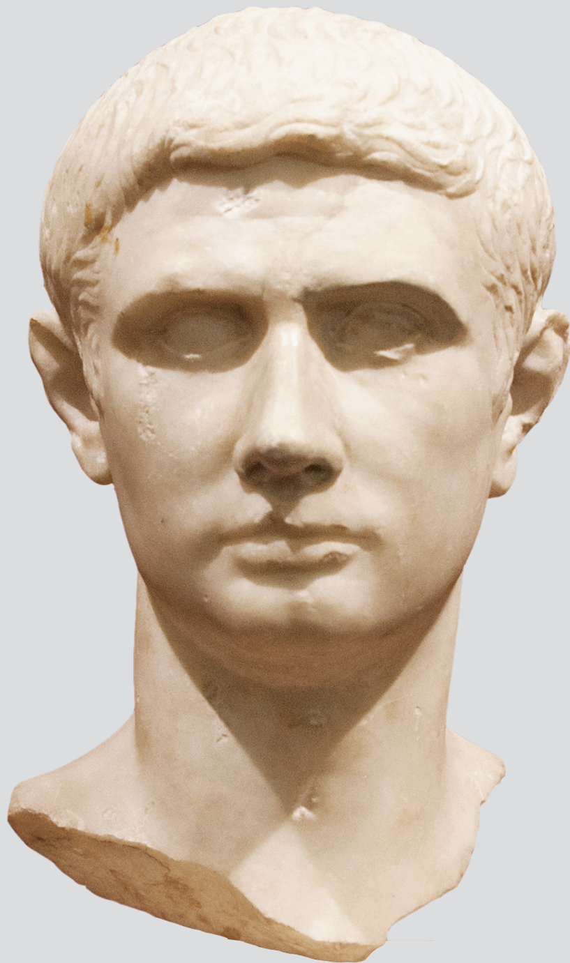
Marcus Junius Brutus